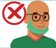
On your chin