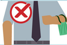
On your arm