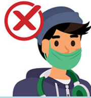
Under your nose