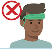
On your forehead