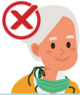
Around your neck