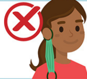
Dangling from one ear