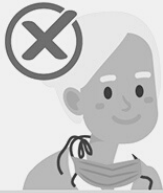
Around your neck