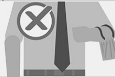
On your arm