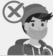
Under your nose