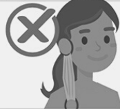
Dangling from one ear