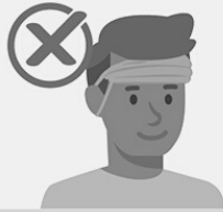
On your forehead