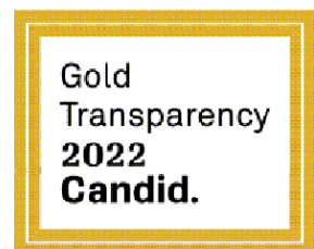
SHARE! received the Gold Seal of Transparency and accountability from GuideStar, a nonprofit information hub.